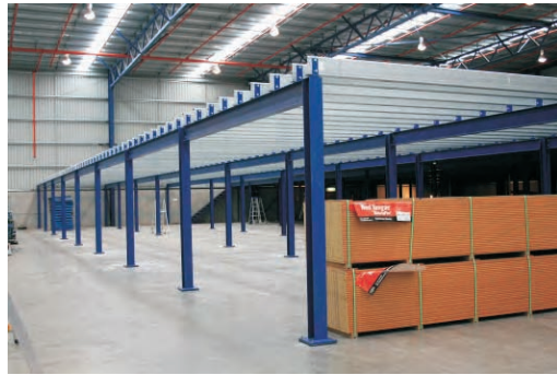
Mezzanine Floor under construction at Just Jeans Altona

Altona. The mezzanine floor at Blue Circle is approximately 1250M 2 and is a double level construction using common support columns. It has spans in excess of 8.4 meters thus providing access for fork lifts and ample storage area