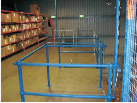
Mezzanine Floor Pallet Gates