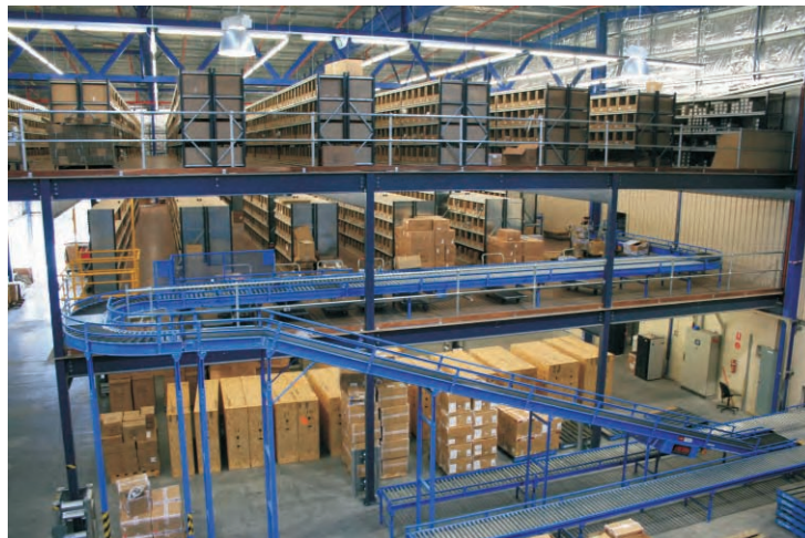
Double Level Mezzanine Floor Installed at Blue Circle.

A mezzanine floor can be constructed to any size