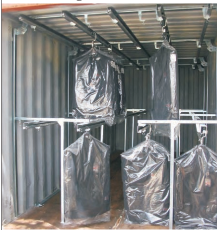
CIS Container System