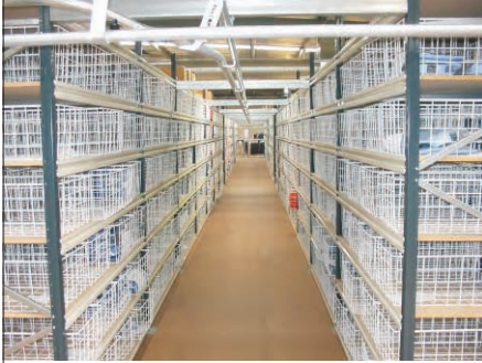
Shelving and Service Rail