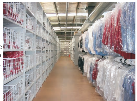
Rack, Rail & Shelving Solutions.

information the staff at Appcon are willing and eager to help with any customer requirements. As others in the industry become complacent with the idea of service to the customer, Appcon consider this our primary focus. At Appcon we are here to help