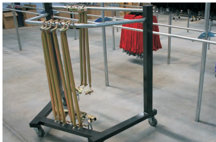
Appcon Rail Trolleys On Trolley Storage Unit.

At only $34.25 each + GST Appcon rail trolleys are the best value for money trolleys on the market. Appcon has designed a neat nesting storage unit for empty rail trolleys. The unit can hold up to 70 empty trolleys and is very easy to manoeuvre.